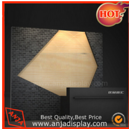
Image Wall and Checkout Counter Furniture